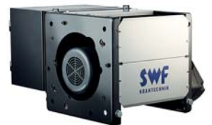
NOVA L Single girder trolley, low headroom, up to 12,5t